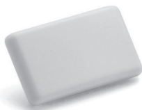
F145-1328 Indoor Remote Sensor