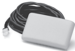
F145-1378 Outdoor Remote Sensor